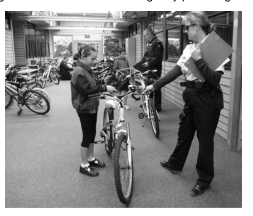
All bikes are safety checked by local police before the Bicycle Education Program commences.

Year 4 students recently began the school's bicycle education and safety program which will culminate in a town ride. We are pleased to have a close association with the Romsey Police Station and three of their members have conducted the bike safety check. This is an important program for our students as safe riding skills are essential especially correct hand signalling and scanning and are sometimes not taught by parents/guardians.